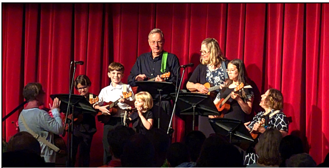
Herndon Ukuleles steal hearts at the Rise Up! Concert.