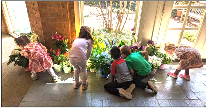
Preschoolers stop and smell the flowers.