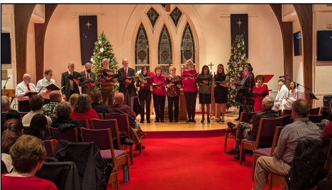
Wesley Choir (9 pm Christmas Eve).

The Herndon UMC Staff loves to hear from you! If you would like to catch up with a staff member, it is best to reach out first, to arrange a time and place. Please share your prayers, joys and concerns, and especially your faith stories. We are here to support you!