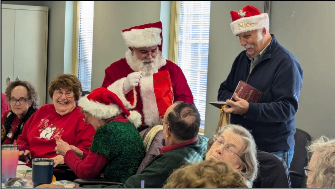
Santa visiting Top of the Hill with his helper.