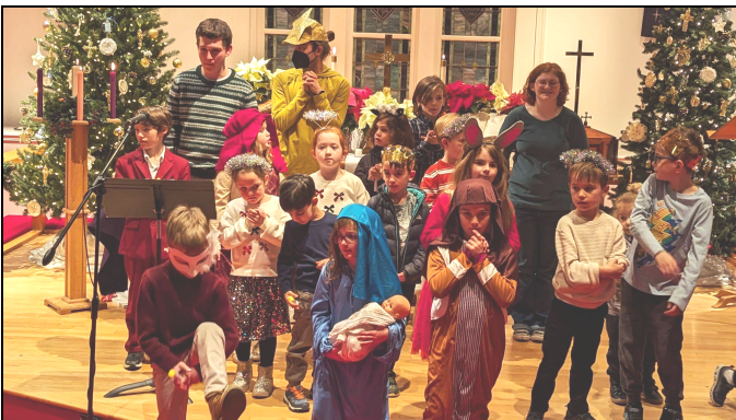
Pop-up Pageant cast picture (5 pm Christmas Eve).